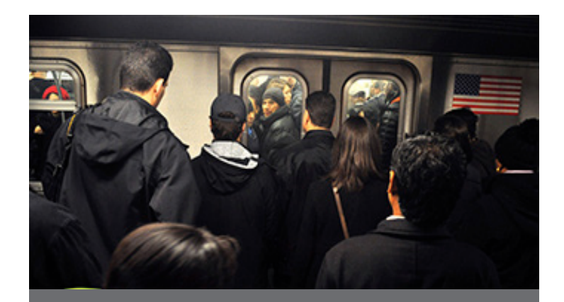
During a morning rush hour last week, passengers wait to board a packed downtown-bound Lexington Avenue line train at the 77th Street station. A full-build of the Second Avenue subway would alleviate chronic overcrowding on the Lex, the East Side's only north-south train route.

Dec. 19, 2012 — Two weeks ago, Remapping Debate <u>published a story</u> detailing how a fully built-out version of the Second Avenue subway — one that can be built quickly and which would maximize benefits to the residents of New York City — remains only a dream. It was clear that the primary cause was a lack of political and budgetary will, but we deferred our reporting on how New York politicians explain this failure.