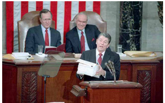
President Ronald Reagan’s 1988 State of the Union speech was accompanied by a written message to Congress titled, “A Union of Individuals.”