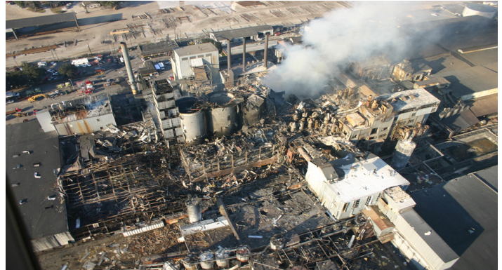
A 2008 sugar dust explosion at a Georgia Imperial Sugar refinery killed 14 people and injured over 40. OSHA had been criticized in a 2006 U.S. Chemical Safety Board report for failing to have in place adequate to standards address dust explosion hazards.

President Carter, on the other hand, is reported to be arguing that he has done more for deregulation than any other president. Carter has asserted that deregulation — including in the area of worker safety — has allowed industries to operate more efficiently and that consumers have as a result had billions of dollars of savings passed along to them every year. Reagan counters by saying that Carter’s actions are only “highly publicized examples of showcase deregulation where Mr. Carter has acceded to congressional demands to deregulate.”