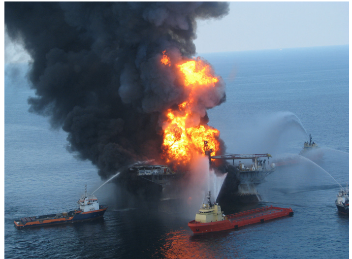
2010 explosion of Deep Water Horizon oil rig, which killed 11 workers. BP has a well documented history of safety violations, including those that have led to oil refinery explosions and have been classified by OSHA as “willful.”

The Washington Post interviews the incoming chair of the Senate Labor and Human Resources Committee, Sen. Nancy Landon Kassebaum (R-Kan.), reporting that “she outlined a legislative blueprint for turning over key regulatory programs to states and scrapping federal job training programs she said no longer serve their purpose.” She says that she intends to shelve labor and OSHA reforms currently in Congress and does not believe that the federal government should “get involved” with smoking in the workplace or repetitive motion injuries.[18]